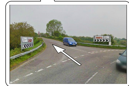
KINGSTON BRIDGE ON CLEVEDON TO YATTON B3133