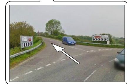
KINGSTON BRIDGE ON CLEVEDON TO YATTON B3133