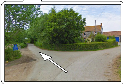
JUNCTION OF HAM LANE WITH BROADSTONE LANE