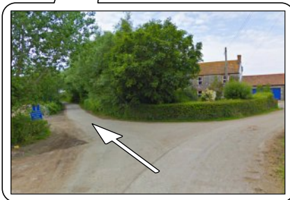
JUNCTION OF HAM LANE WITH BROADSTONE LANE (KEEP LEFT)